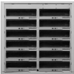
12 Lid Configuration Standard Density Opening: 10.83"W x 2.21"H* (275mm x 56.1mm)