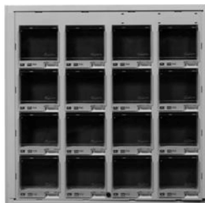
16 Lid Configuration High Density Opening: 4.96"W x 4.02"H* (125.98mm x 102.1mm)