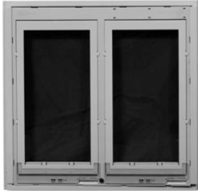
2 Lid Configuration Standard Density Opening: 10.83"W x 20.07"H* (275mm x 509.8mm)

*Opening sizes are for exterior dimensions