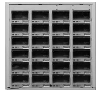
24 Lid Configuration High Density Opening: 4.96"W x 2.21"H* (125.98mm x 56.1mm)

NOTE: Compartment depth will vary and is dependent on drawer depth.