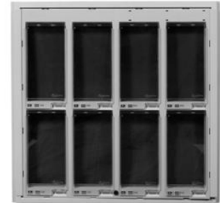
8 Lid Configuration Standard Density Opening: 4.96"W x 9.50"H* (125.98mm x 241.3mm)